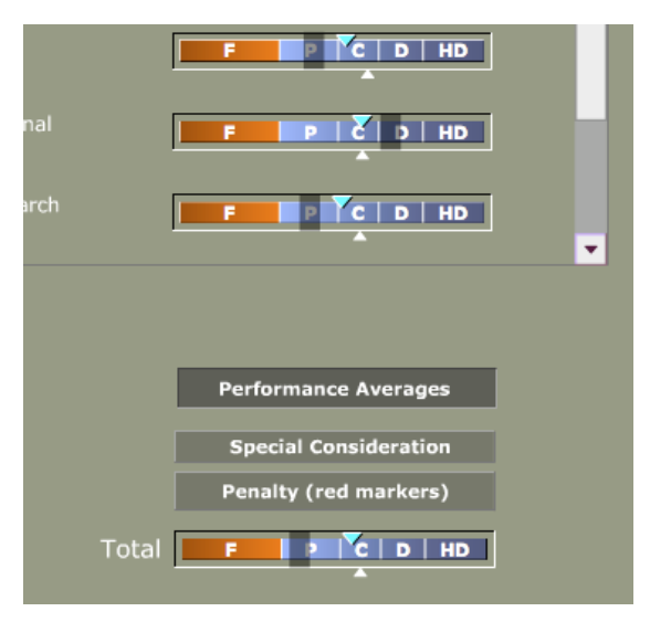
Figure 2 - Students view of a screen portion showing the tutor's feedback (broad translucent grey vertical bars on the grading scales) and the student's own self-assessment (triangles above the grading scales)3

When tutors and subject coordinators have bench-marked their assessments and comments, they are 'published' for students to view online through a web browser. Figure 2 shows an enlargement of the student's view of data sliders, with grading scales against criteria, after the subject coordinator has published the assessment.